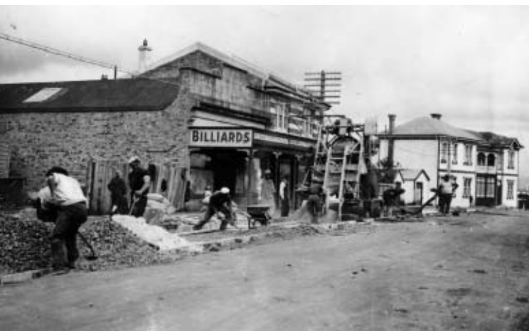
Laying concrete road, Queen St late 1920s. Northcote library collection.