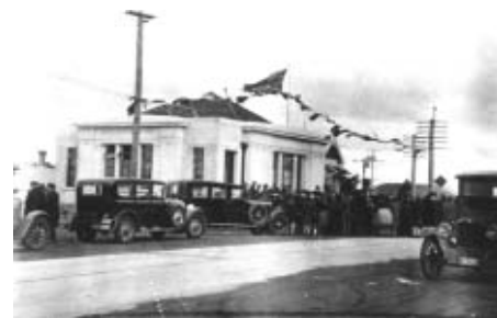
Opening of Northcote Post Office, Queen St, 1929.

The construction of the Auckland Harbour Bridge and motorway in the late 1950s drastically changed the Northcote Point environment. The eastern coastline was obliterated, the ferries ceased, shops closed, and the Point became something of a backwater. Rapid northward development took place and the Northcote Shopping Centre opened in December 1958.