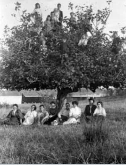
Picnic at 'City of Cork', North of Northcote Point, pre 1900.

Today, Northcote Point enjoys the advantages of a small backwater close to the city. With its many old villas and other historic features, a beautiful coastline and spectacular views, it is one of the Shore's most interesting heritage areas.