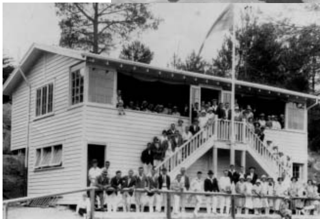
Northcote Tennis Club opening in Shoal Bay, 1925.