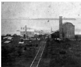
Sulphur Works c.1884