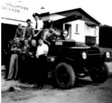
Northcote Fire Brigade, Northcote library collection.

The Borough of Northcote was formed in 1908. The first council meeting was held in these new chambers on March 12, 1912. Informal council meetings - known as 'the Funnel Committee' - were often held around the funnel on the ferry, as only one councillor did not catch the 8.30am ferry to the city. The chambers moved to the Northcote shopping centre in 1959 and the old chambers became a branch library and then a crèche.