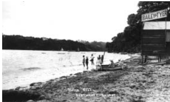
Hall's Beach