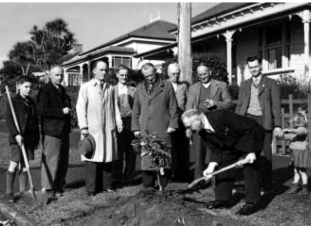
Tree planting in Richmond Ave, late 1940s.

This 1940s English cottage-style house was designed by M.K. Draffin, who also designed the Auckland War Memorial Museum. Recent additions to the northern end complement the original design.